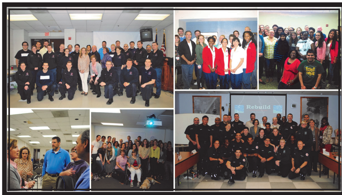
Pictured below you will find the many groups that have benefited from the TSN Community Presentations.

The importance of these presentations is two-fold. It’s important for the community to understand what truly happens to a person from the moment of trauma through their long-term recovery. The stories they hear stick with them for a long time, and our hope is that they think about trauma victims as more than just patients, but as people with homes and jobs and families who have a long recovery journey ahead of them. The presentations are also important for the trauma survivors, as they give them the chance to educate through personal experience, to process and organize their thoughts around what they’ve been through, and also to say “thank you” to those who choose to dedicate their lives to healing and helping others.